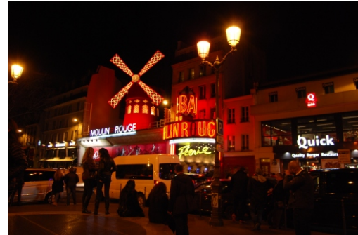
And the famous: Moulin Rouge