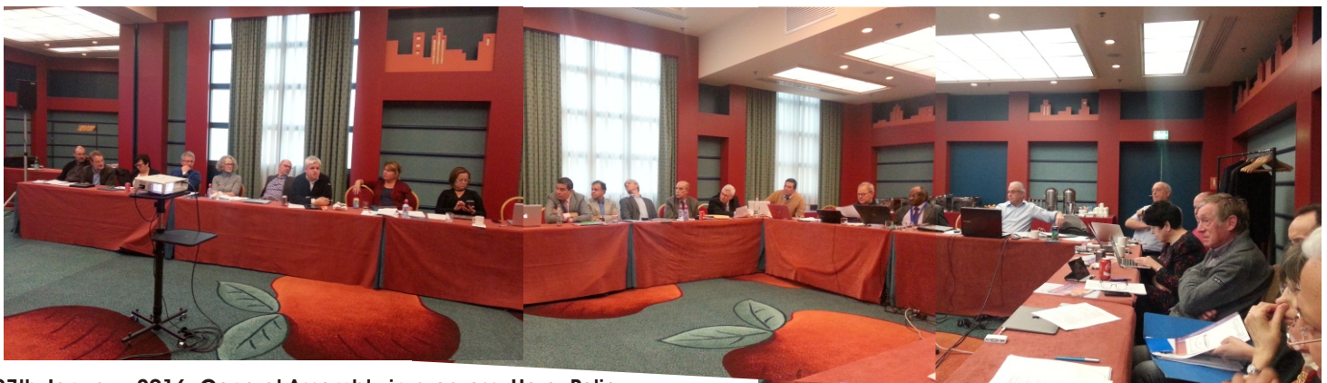
27th January, 2016, General Assembly in progress. Here, Policy decisions governing Day Surgery around the world are discussed, progress of every country is noted, difficulties overcome by suggestions and future Congresses organised.

The General Assembly meets every year, with inclusion of new members, it has grown in numbers, we have become a large family of Ambulatory Surgery, supporting each other.