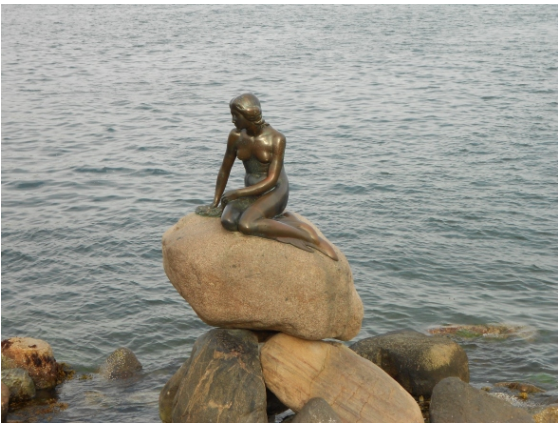
The iconic 'Little Mermaid' Copenhagen, Denmark