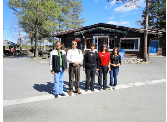
At the Arctic circle, 'Land of Mid-night sun', Finland.