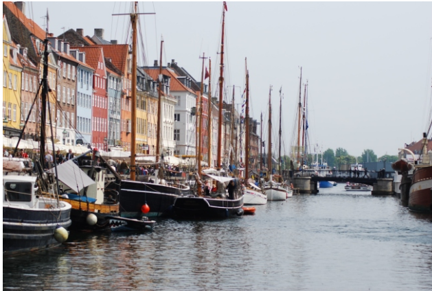
Nyhavn, famous for its night life, Copenhagen.