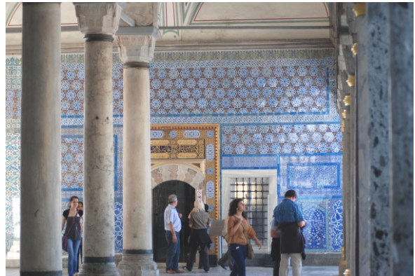
Circumcision Room, inside the Topkapi Palace, in Istanbul, Turkey, where, the procedure was performed as One-day case during the Ottoman rule.