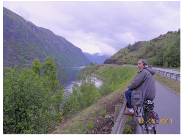
Cycling(after 30 yrs.!) around the fjord in Flam, Norway.