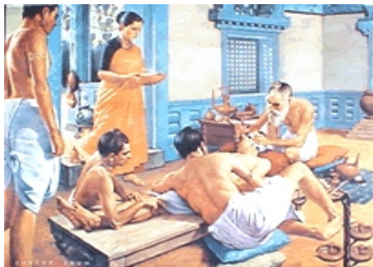
Susruta (5th Century BC) The Great Surgeon of Ancient India

While discharging you from the hospital, we make sure that you are reasonably fit to go home or to your hotel. Any assistance that you may require, will be provided by a team of doctors. In case you are not fit to be discharged, then you may be asked to stay back overnight for observation.